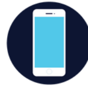
CUANDO LAS TELECOMUNICACIONES FALLAN