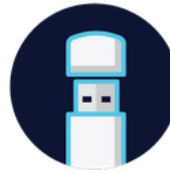
ALMACENAMIENTO DIGITAL DE DOCUMENTOS IMPORTANTES