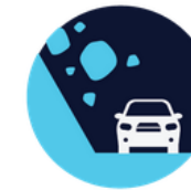
ALERTA A DERRUMBES