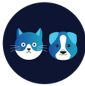
PROTEGE A TUS MASCOTAS