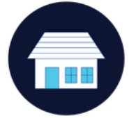
PREPARA TU CASA