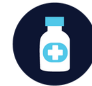
ASEGURA TUS MEDICAMENTOS