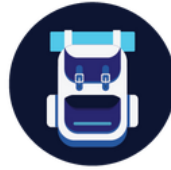
PREPARA UN BULTO DE EMERGENCIAS