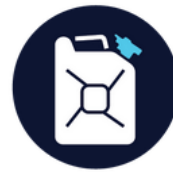
CÓMO ALMACENAR COMBUSTIBLE