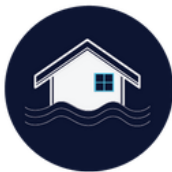
INUNDACIONES, CONOCE TU ZONA