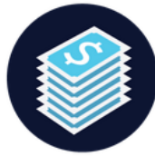
AHORRA Y GUARDA DINERO EN EFECTIVO