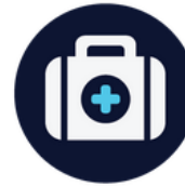
PLAN DE PRIMEROS AUXILIOS