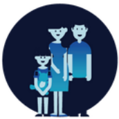
PLAN DE EMERGENCIA FAMILIAR